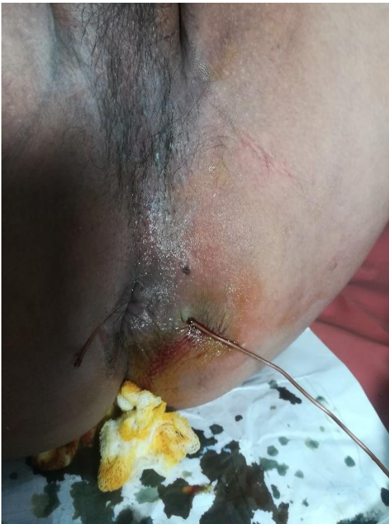
Fig. 1. On first day of consultation: probing done at 3- 3 0' clock