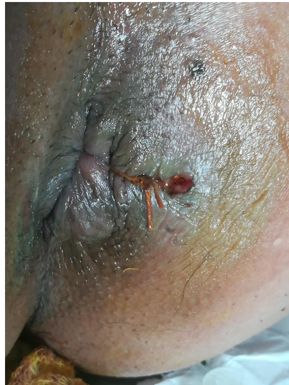
Fig. 2. Kshara sootra ligation at 3-3 o'clock