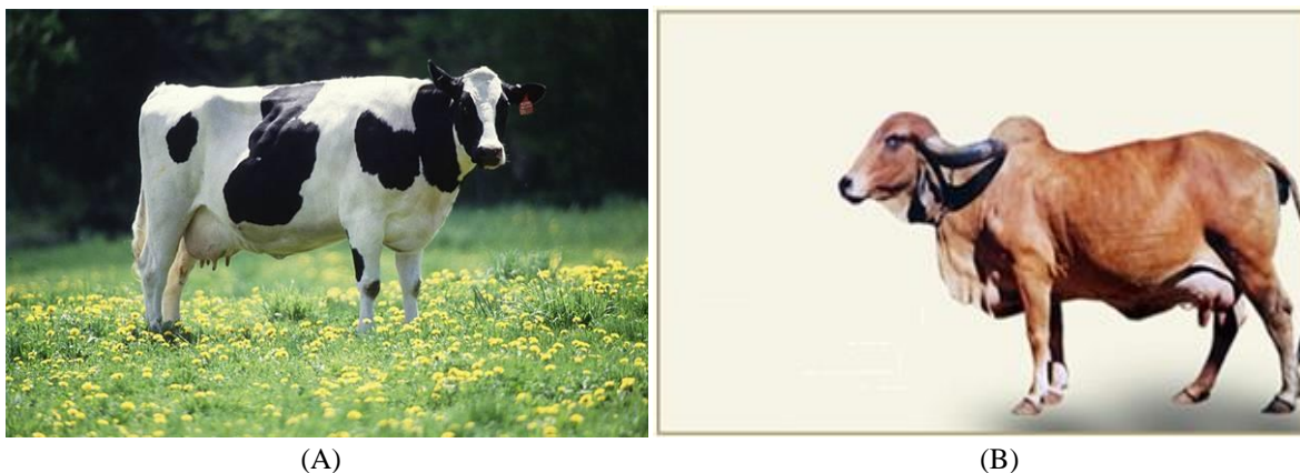
Fig 3: Difference between Holstein cow(A) and Gir cow(B)

(A) No hump, small ears, smaller flat forehead, small neck, table top hind legs posture