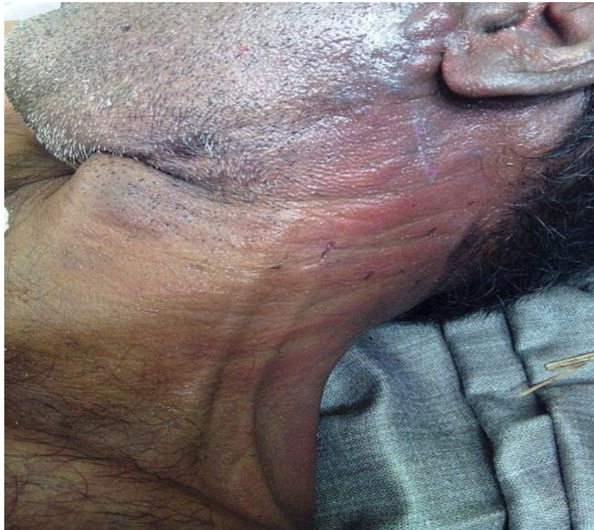
Legend of figure-2:- Multiple crescentic abrasions.