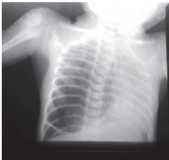
Figure 1. Infant, premature, Infant, low birth weight1Chest X-ray of the child

Finding likely represented congenital cystic adenomatoid malformation (CCAM) Type 1.