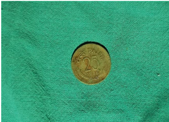
Fig. 3: removed foreign body coin from posterior choana