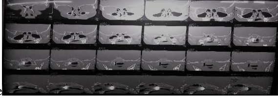
Fig. 2: showing coronal view of CT paranasal sinus with a radiopaque shadow in between the septum & inferior turbinate at the level of posterior choana