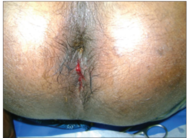
Figure 4: After cutting of thread

The aim of the treatment should be in addition to correction of the prolapse, the functional disturbances also should be corrected. Among factors to consider in the selection of a treatment option are the age and health of the patient,