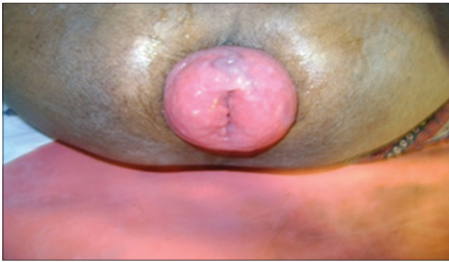
Figure 1: Prolapse rectum