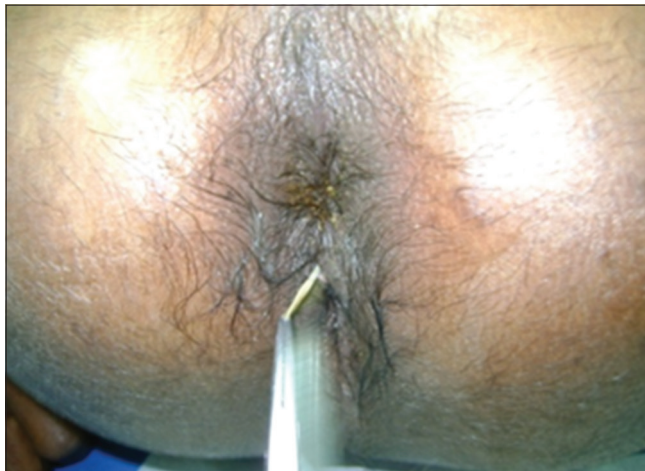
Figure 3: Cutting thread after 15 days

age. Rectal bleeding and mucoid discharge are frequent symptoms. Incontinence is frequently associated with this condition. The main clinical feature of rectal prolapse is a protruding of mass following defecation. Rectal bleeding may be noted following bowel activity. Rectal prolapse frequently is accompanied by a mucoid discharge. [15]