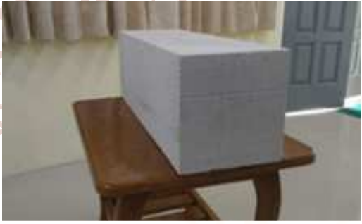
Fig.1. AAC block

The photographic view of the AAC blocks (1) length-600mm, height-200mm, thickness-200mm, Cost-1800 kyats and (2) Length-600 mm, Height-200 mm, Thickness-100 mm, Cost-950 kyats are shown in Figures 1 and 2.