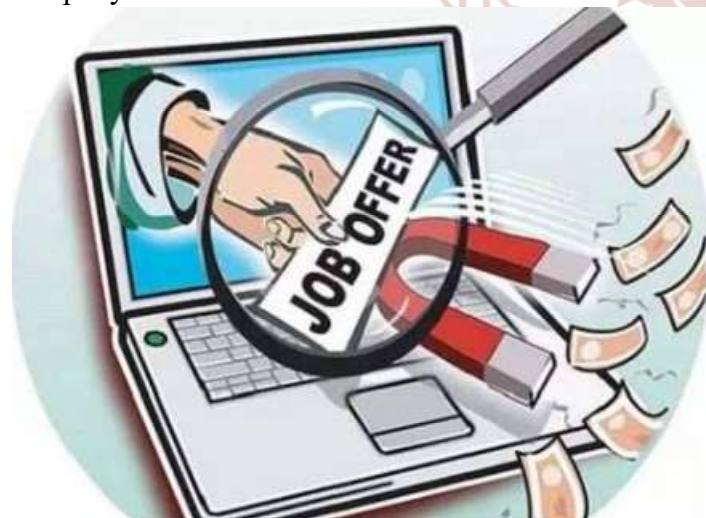
Fig. 3 Wiring money before getting hired

If in case, they demand to pay then for sure the company is fake.