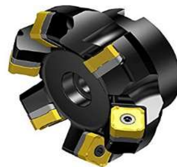
Figure 2: Face Milling Cutter