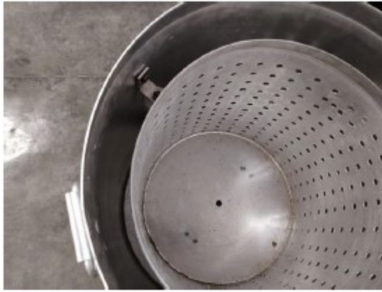
Figure 4: Perforated inner drum with rollers

that the inner drum rotates on its axis with least friction and more speed of rotation.