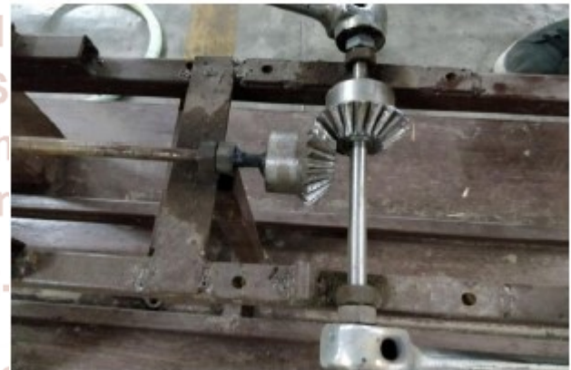
Figure 3: Bevel Gear Assembly

Figure 2 shows the working model of the washing machine that is designed and fabricated. The design that we have fabricated contains Bevel Gear. (see Figure 3)