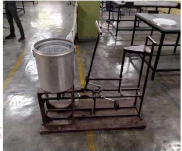
Figure 2: Working Model

Figure 2 shows the working model of the washing machine that is designed and fabricated. The design that we have fabricated contains Bevel Gear. (see Figure 3)