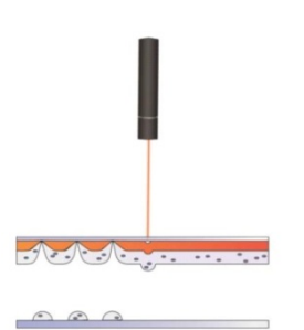
Figure 4.1. Representation of Laser-based bioprinting process.

large amount of gas pressure is generated to push biomaterial on to substrate.