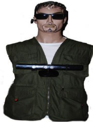
Figure 4: Microsoft kinect, final prototype.

request and caution the previously mentioned client to maintain a strategic distance from these impediments. Second, this interface was improved with every one of its subtle elements into a self maintaining framework that would be upheld on the client, so it's deliberate even a little bit circumstances. Last however not least, an application that guarantees the correspondence between the client and his/her guide was made. This whole framework can go about as a virtual eye for the client. To actualize a route framework, we require a pack of sensors and furthermore a preparing unit to investigate every one of the information being caught by the given sensors. In this, the most appropriate sensor is the Microsoft kinect.