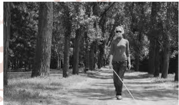
Figure 1: A blind person

an individual doesn't see well. Vision impedance will differ from fragile to extreme. India comes in the next range of blind folks at international forums due to its definition. India currently has around twelve million blind folks against thirty-nine million globally, that makes India home to simple fraction of the world's blind population. The estimated range of individuals who are visually impaired within the world is 300 to 400 million, among which 50 million are totally blind and few having low vision. Approximately 80% of visual impairment happens in individuals more than 50 years old. Regular reasons for visual impairment are complexities of diabetes, macular degeneration, horrendous wounds, contamination of the film or tissue layer, glaucoma, and powerlessness to get any glasses.