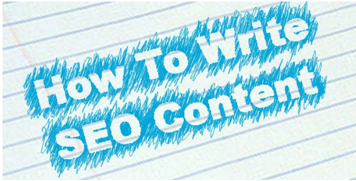
Fig 3.6 how to write SEO content