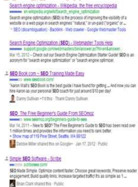
Fig 3.9 Google Trends

Let’s say you run a hardware store and you want to ramp up sales of shovels this winter. When people search for a shovel online, do they search for winter shovel or snow shovel? Compare the two using Google Trends. Here’s what you’ll see: