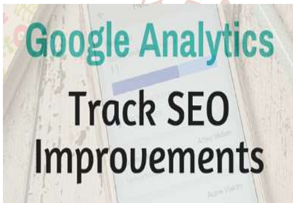
Fig 3.8 Track SEO improvements with Google Analytics

The last point of every “What is SEO and How does it Work Guide” is the tips to track or monitor your SEO campaigns and related outcomes. The two most critical tools you can use to screen these outcomes are-