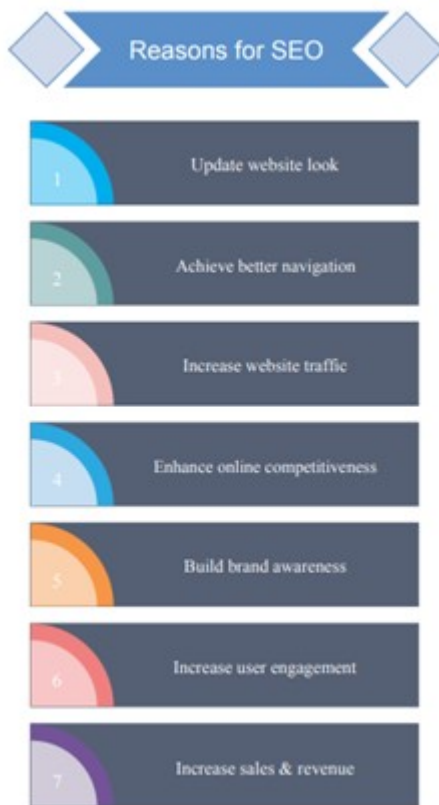
Fig 3.2 Reasons for SEO

Customers' needs are changing. Others competitors are improving and more websites are being built every moment. There is no way to gain best SEO without constant improvement of the website.