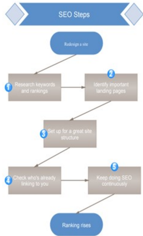
Fig 3.1 SEO stapes