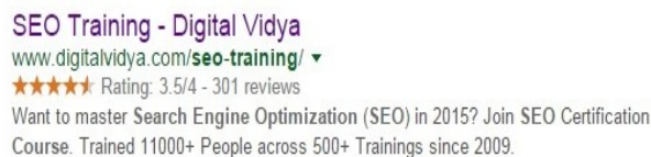
Fig 3.4 SEO title and meta description

Title Tag and Meta Description in Search Results