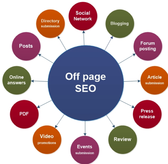
Fig 3.5 Off page SEO

Link Building is presumably a standout amongst the most discussed SEO topics covered in “How SEO Works” Guides. The fundamental objective of third-party referencing is to get different sites to link to yours to increase traffic and search ranking.