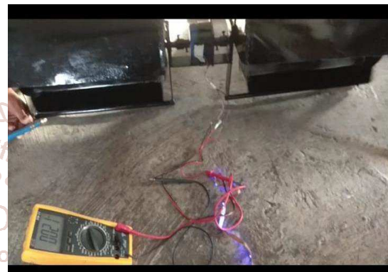
Fig. Voltage Measure in Compressor Pressure