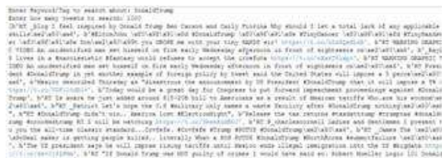
Fig4 Fetched Tweets for Donald Trump

How people are reacting on DonaldTrump by analyzing 1000 tweets. General Report: Tweeters donot like DonaldTrump