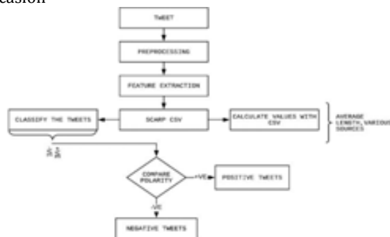
Fig 2 Architectural Flow of Twitter Analysis

In this method we uses text blob as a method to find the polarity of the text (positive text, negative text or neutral text). The tweets are imported from the Twitter using the (API) provided by the Twitter Developer. From these API various fields like tweets, source, retweets, likes, language, user etc. can be scrapped. After collecting these data, we can analyses the various famous person thoughts on anevent or occasion