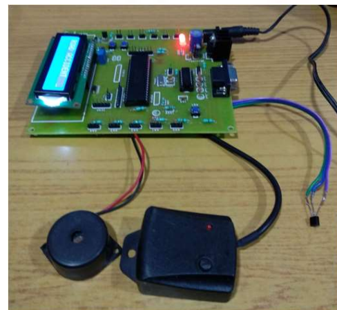
Fig.3. Hardware connection of the system

Vibration sensor and Fire sensor detects the collision and fire breakouts respectively. As soon as the collision or fire is detected, the buzzer goes on. It communicates with the application in the Smartphone through Zigbee Bluetooth. If the driver doesn't want to communicate any information, he can cancel using the reset switch. The PIC microcontroller consists of five ports namely A,B,C,D,E. The vibration sensor, fire sensor, buzzer, LED display and Zigbeebluetooth are connected to these ports. Fig.3 below shows the hardware connection of the system.