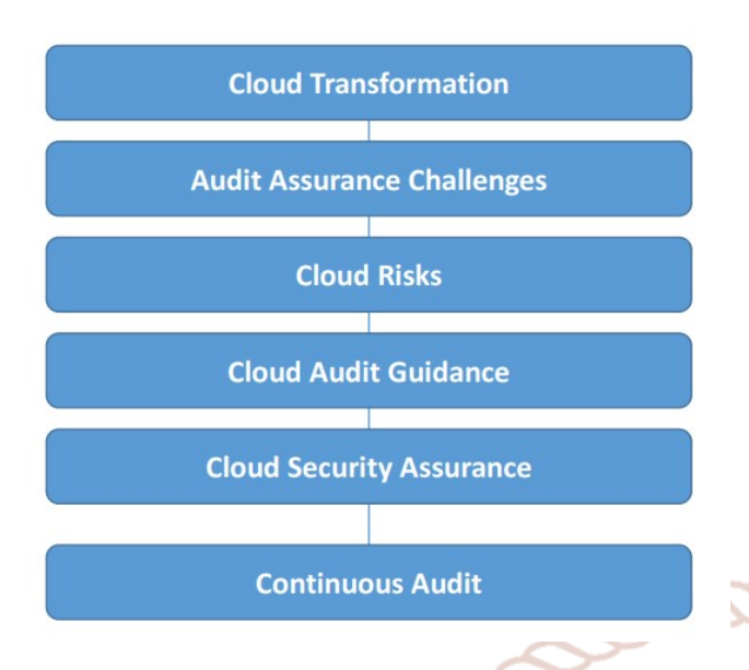
Fig. 1 Continuous Auditing in cloud