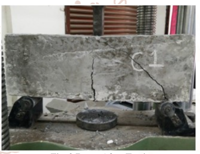
Fig. 2 Beam After Testing