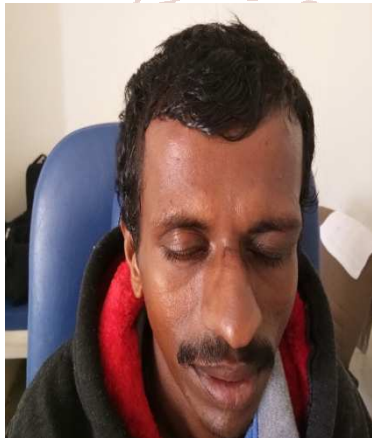
After treatment A