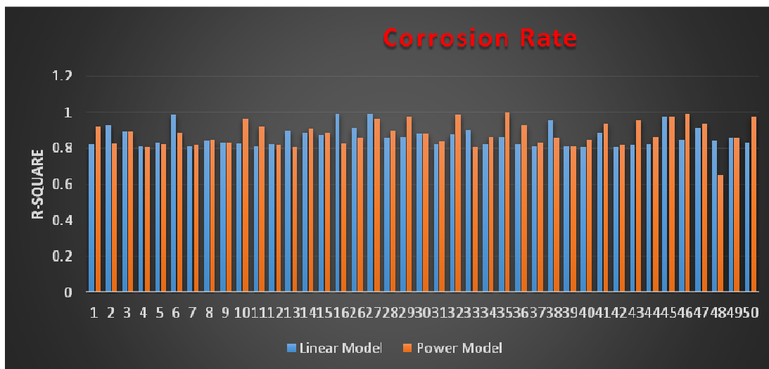
Figure 3: Corrosion Rates for Pipelines