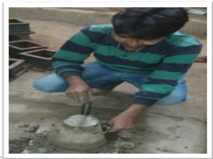
Fig. slump cone apparatus

mixture. Extra water (other than the water used for the preparation of alkaline solutions) and dosage of super plasticizer was added to the mix according to the mix design details. The fly ash & Metakaolin and alkaline activator were mixed together in the mixer until homogeneous paste was obtained. This mixing process can be handled with in 10 to 15 minutes for each mixture with different ratios of alkaline solution. The entire specimen transferred to oven set at 60°C and stored for 24 hours then after ambient temperature. Both curing time and curing temperature influence the compressive strength of Geopolymer concrete. After casting the specimens, they were kept in rest period for two days and then they were demoulded. The demoulded procedure is similar to that of routine conventional concrete.