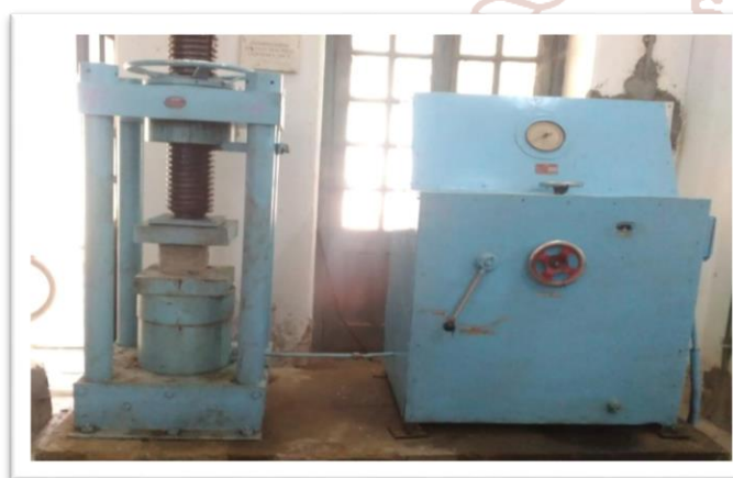
Fig. compression test apparatus