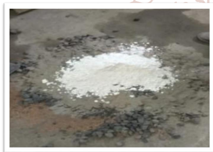
Fig. preparation of geopolymer concrete mix