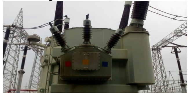
Fig-1.5: Special vision of Tertiary winding of Power Transformer by inspection robot using remote