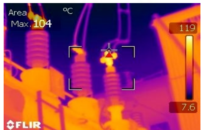
Fig-1.6: Analysis of hot spot by inspection robot

In order to ensure the safety of the inspection robot and its detection operation, the inspection robot process need to be monitored by operators in real time, then the operators and inspection robot need the information exchange interface, which can also provide the platform for the analysis and early warning of substation equipment. The background monitoring system, which includes the monitoring system, analysis and early warning system, is such an information interaction platform between inspection robot and the operators as shown in fig. 1.6. Pointer shows highest temperature on top of bushing right side i.e. 104°C temp detect by robot.