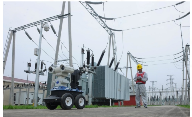
Fig-1.1: Power substation robot operated manually by operator

power substation inspection robot is composed of mobile vehicle platform, testing sensors such as IR and corona detection cameras, the control and communication unit, and so on, have been discussed. The inspection system based on the robot have sensor of visible Charge-coupled Device (CCD) also required, which help people to achieve better reliability. In India these technology was not on peak, but a regular study has been carried out by many research centre. Following fig 1.1 shows example of robot which have camera over it and controlled by a operator manually.