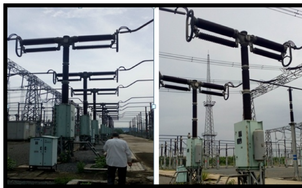
(A) Large Range (B) Short Range Fig -1.2: Power substation environment

Navigation Technology of Power Substation Inspection Robot – Inspection robots move and inspect on the road of substation equipment inspection area which is a kind of unstructured environment of strong electromagnetic fields and equipment shades. Furthermore, the substation environment scope is large and the ground natural features that the computer vision can recognize are little (see Fig.1.2).