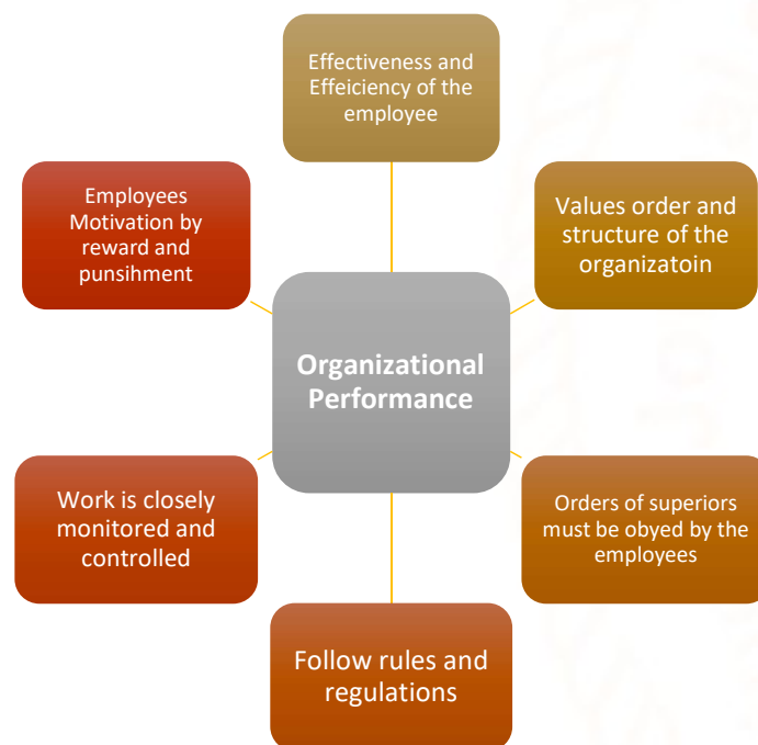
Figure 3: Transactional Leadership's impact on the organization