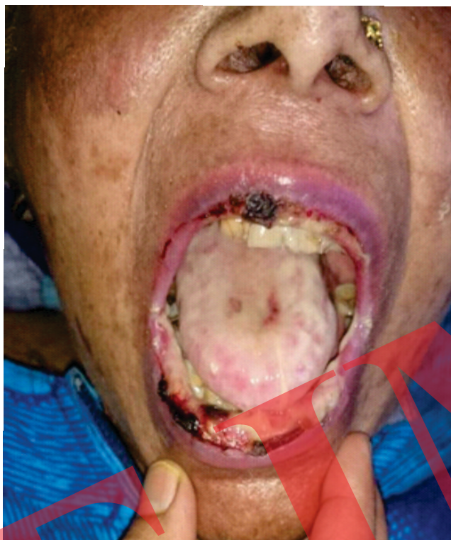
Figure 2: Desquamation of tongue with edema, crusting and bleeding of lips

with severe itching and mild pain. Gradually these rashes developed in bullae and blisters all over the body starting from face to hands and legs, then to abdominal region and to the back. She also developed purulent discharge from mouth and ulceration of buccal mucosa and desquamation of tongue (Figure 2).