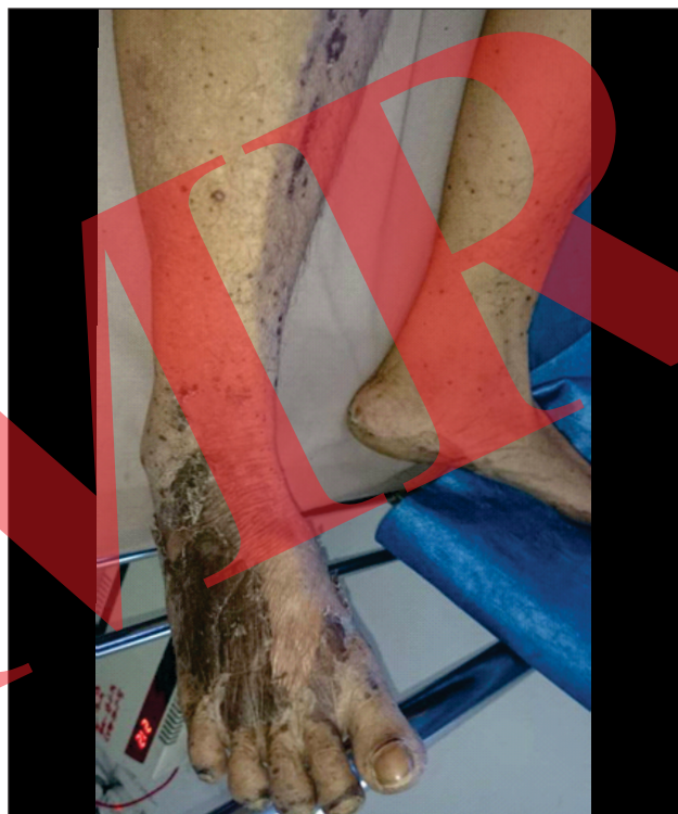
Figure 3: Crusting seen in lower limb

Gradually the condition of the patient improved and after 2 days, crusting of rashes, bullae and blisters started developing and edema, erythema and itching subsided. (Figure 3)