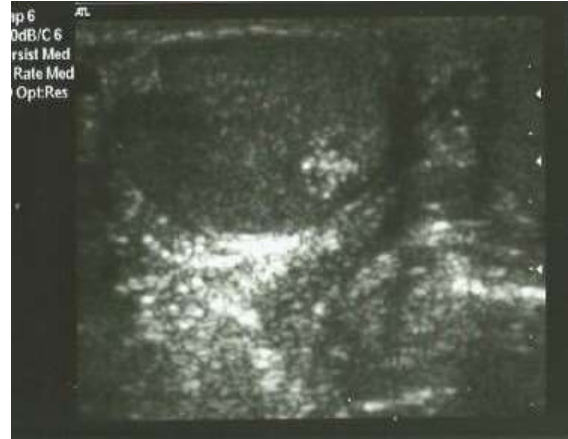
Fig. 2. Ultrasonography revealed compromised blood circulation, calcifications and necrotic areas on the testes.

history. The patient was treated with systemic prednisolone and colchicine. The complaints of the patient were regressed in two days and he was discharged on fifth day of hospitalization.