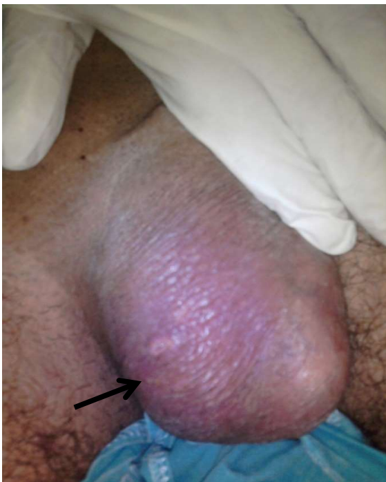
Fig. 1. Scrotal ulceration in addition to scrotal hyperemia and edema.

A 14 year-old boy was admitted to our clinic with scrotal swelling, edema and pain had been lasting for 3 days. His medical history was relevant for similar clinical symptoms occurring two years ago and he had been operated for diagnosis of testicular torsion. After the operation the surgeon was informed the family that there was no torsion, but only inflammation. He had recurrences almost every month after the operation. The boy was diagnosed as BD when he was 12 years old. Three scrotal ulcerations in addition to scrotal hyperemia, edema and tenderness was remarkable on physical examination (Fig. 1).