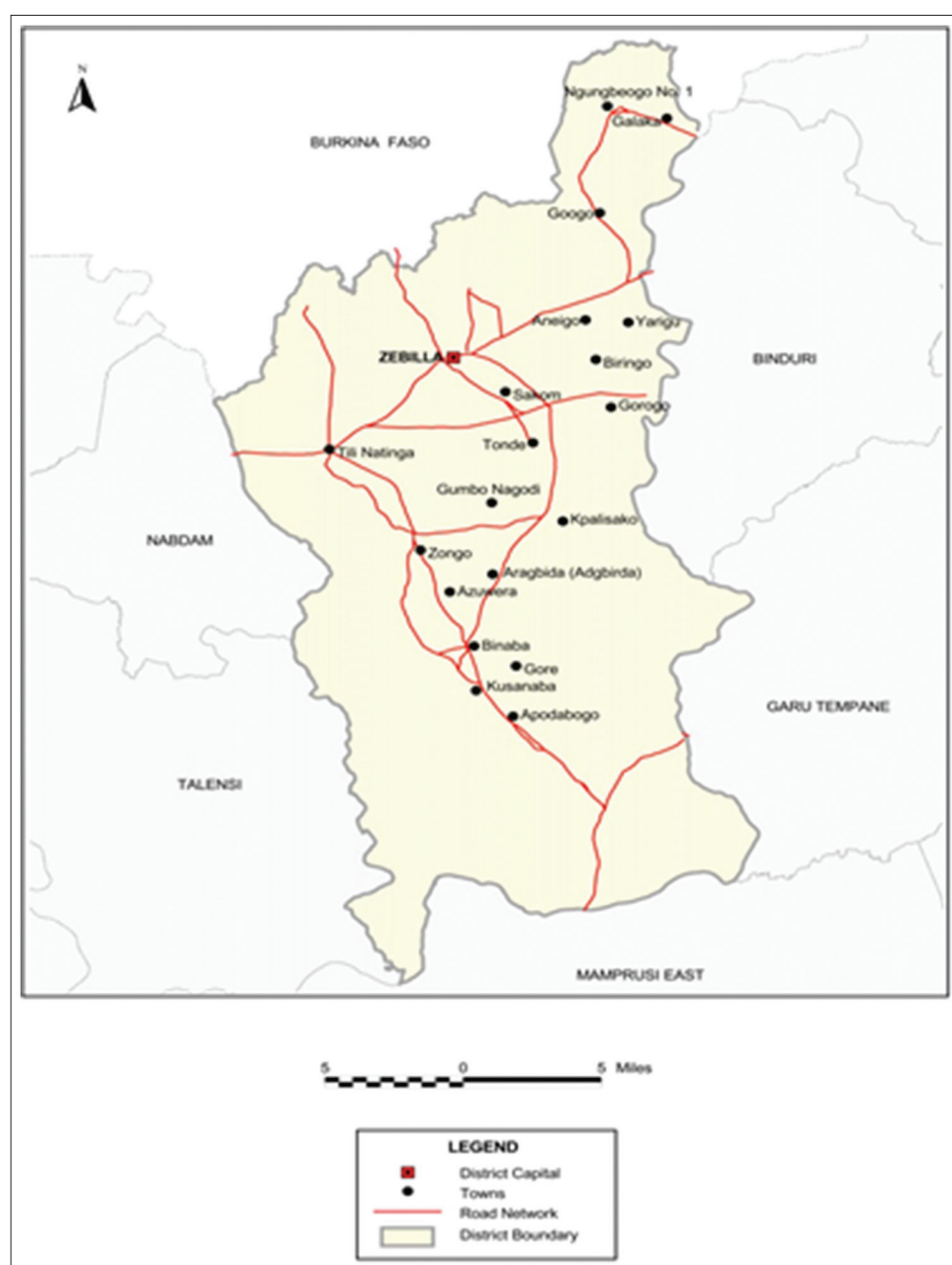
Figure 2: Map of Bawku West District.

Agriculture constitutes the dominant economic activity in the district with >80\% of the active population deriving their income and livelihood from agriculture. The total arable land in the districts is 58,406 ha. [24] The main agriculture activities in the district include crops farming, livestock, and agriculture-related activities mainly agro-processing such as pito brewing, shea butter extraction, groundnut oil extraction, malt production, rice processing, and dawadawa processing. [24]