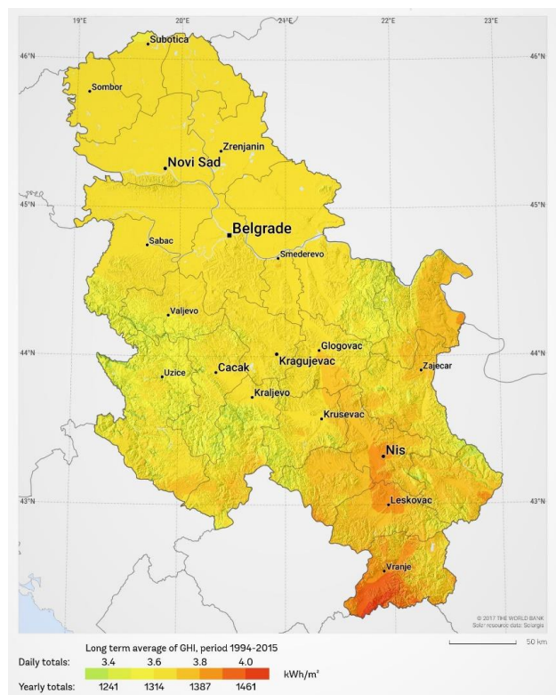
Fig. 2. Global horizontal irradiation - Republic Serbia

Heat solar systems are often used for heating of sanitary water, heating of technical water, heating of water in pools, etc. [44]. Solar energy can cover 50–70% even more of annual energy demand for water heating in households, during summer and transitional periods can be substitute almost