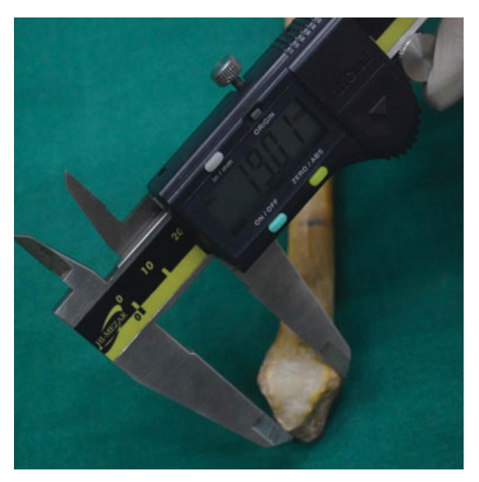
Figure 2: Illustration showing measurement of posteromedial distance of the facet for talus.