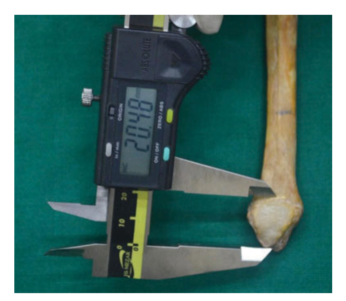
Figure 3: Illustration showing measurement of maximum height of the facet for talus.