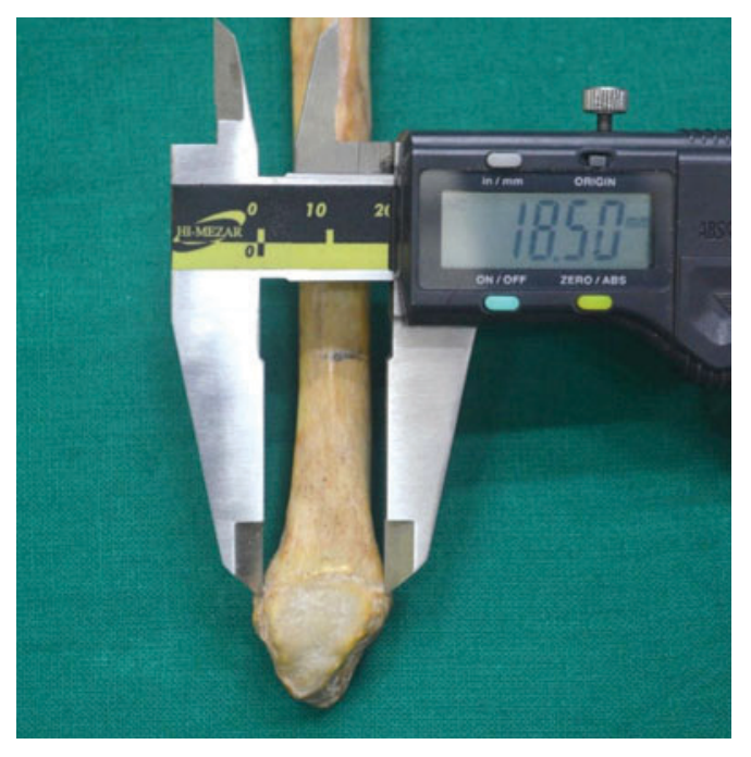
Figure 4: Illustration showing measurement of maximum width of the facet for talus.