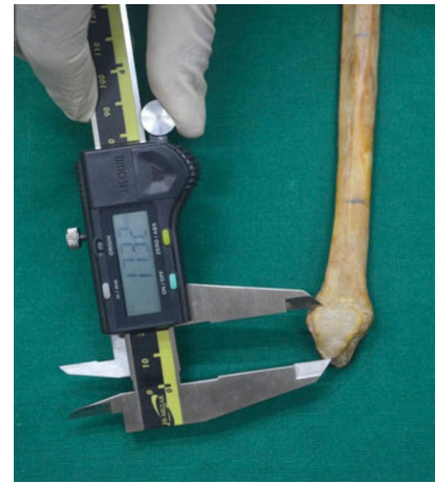
Figure 1: Illustration showing measurement of anteromedial distance of the facet for talus.