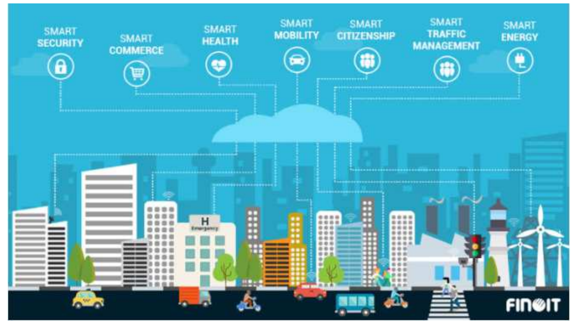
Figure 1 A typical smart city [9].